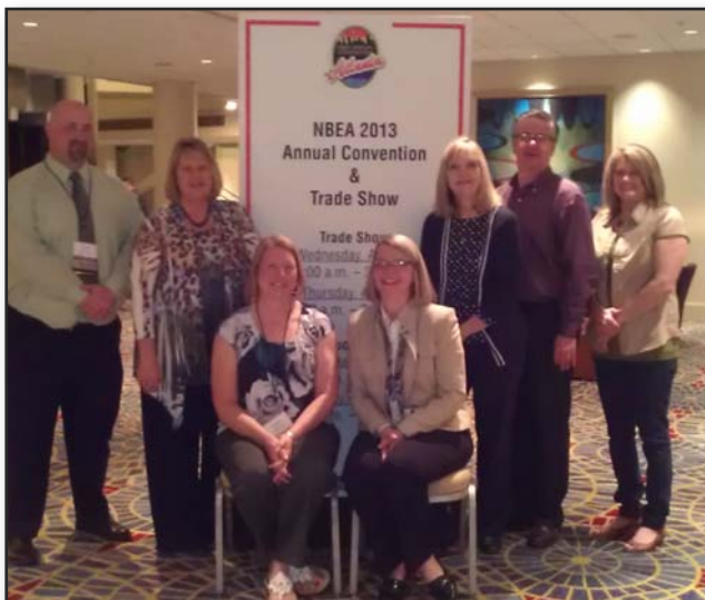
↑ MBEA members attend the NBEA Conference in Atlanta, GA, April 17-20.