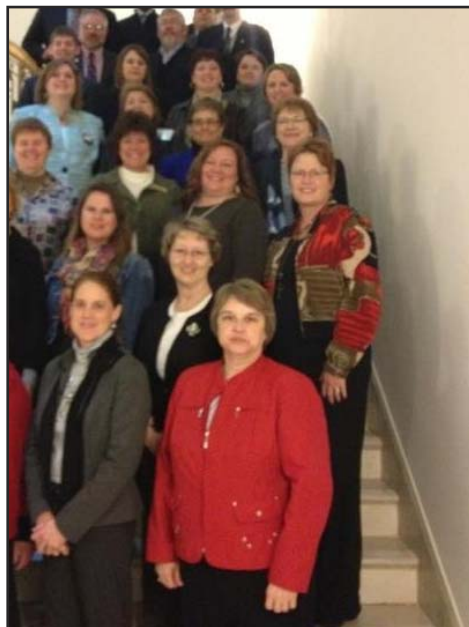
↑ Senator Blunt met with the Missouri ACTE delegation and discussed education issues.