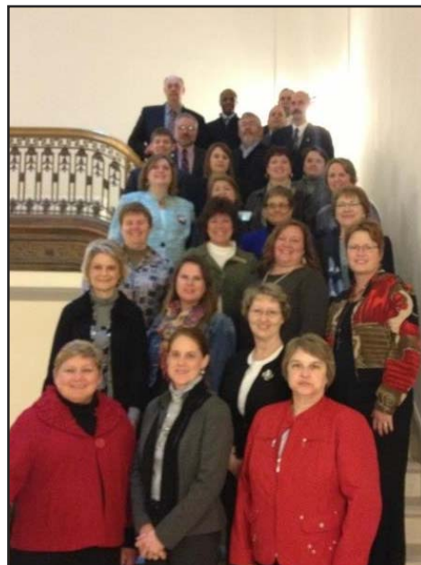
↑ The Missouri ACTE Delegation visits the House of Representatives in Washington DC