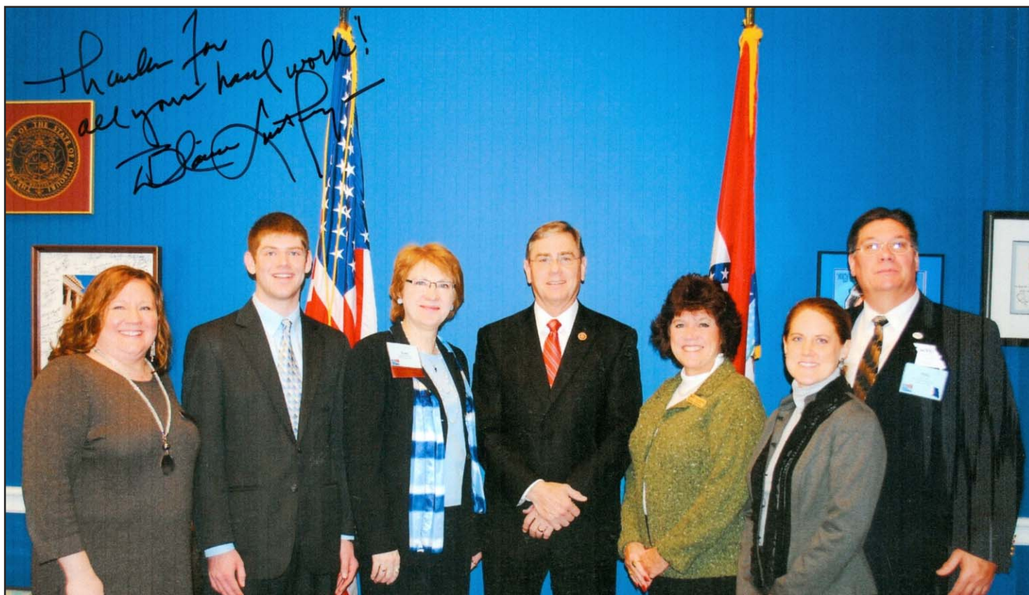
↑ Members of the Missouri delegation to the National Policy Seminar took a moment to pose with Representative Blaine Luetkemeyer (pictured center), who graciously signed the photo, thanking us "for all our hard work!"