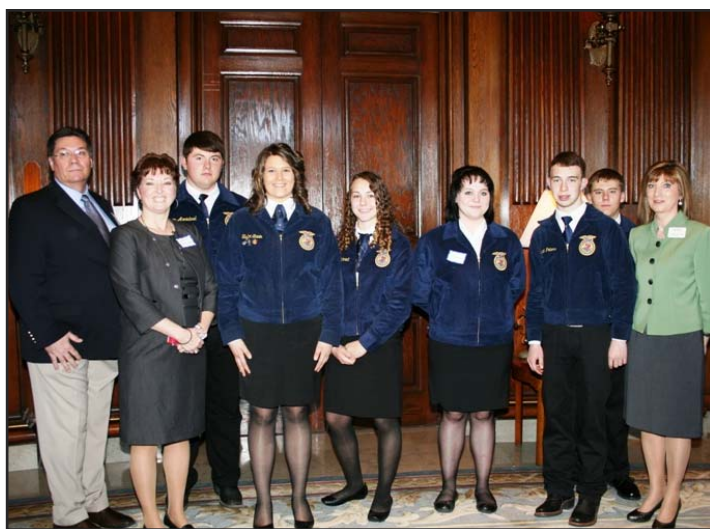
↑ FFA Students pose in Governor Nixon's office during Missouri ACTE's Legislative Day on February 13.

Keep in contact with your legislators. You have a voice and that voice matters.